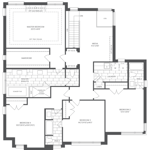
SECOND FLOOR PLAN X