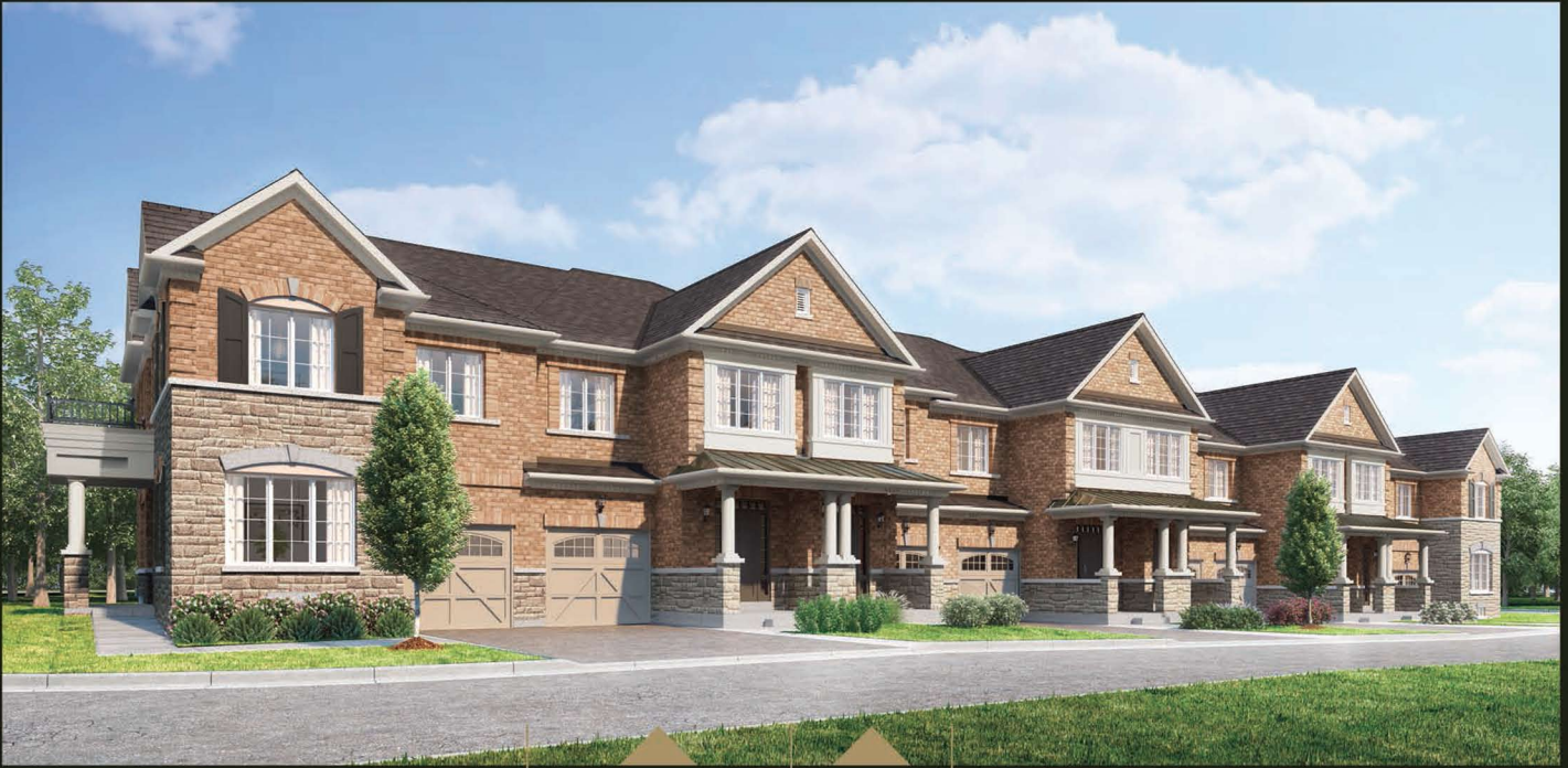
TH7 (REV) ELEVATION 'A'