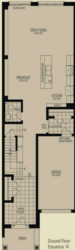
Ground Floor Elevation 'A'