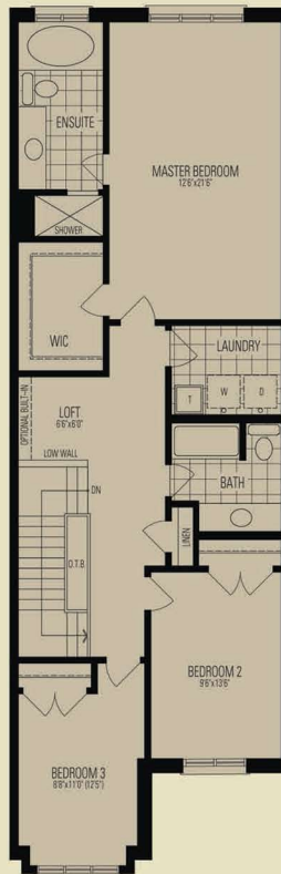
Second Floor Elevation 'A'